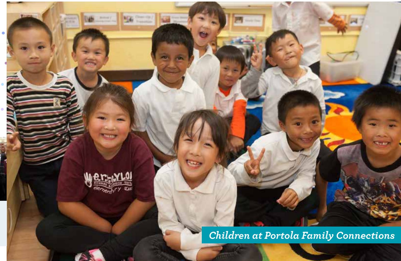
Children at Portola Family Connections