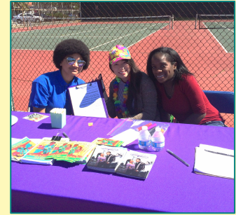
Richmond youth question mayoral and council candidates in debate